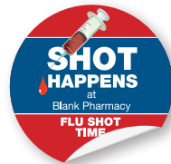
Stickers: Version A size: 2 x 2