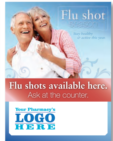
Counter card w/ easel back (8.5 x 11)