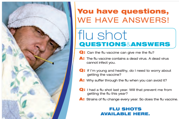
Counter mat (17 x 11)