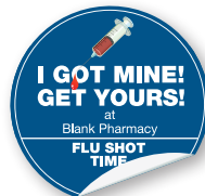
Stickers: Version B size: 2 x 2