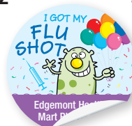
Stickers: Version C size: 2 x 2